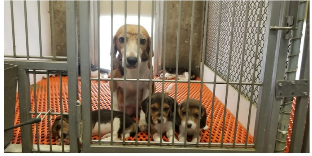
Dogs at a breeding facility in Cumberland, Va. The facility is owned by Envigo, an Indianapolis-based firm that provides research-related service for the pharmaceutical and biotechnology industries.